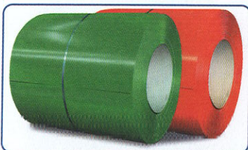
COLOUR COATED COILS